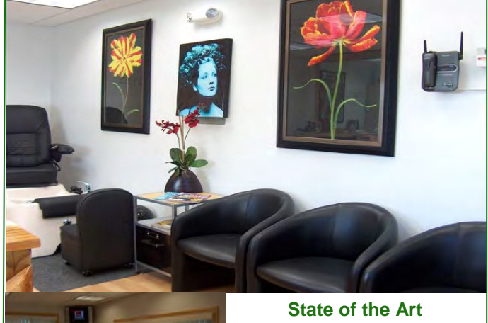
Day Spa Hair-Skin-Makeup We have it ALL!